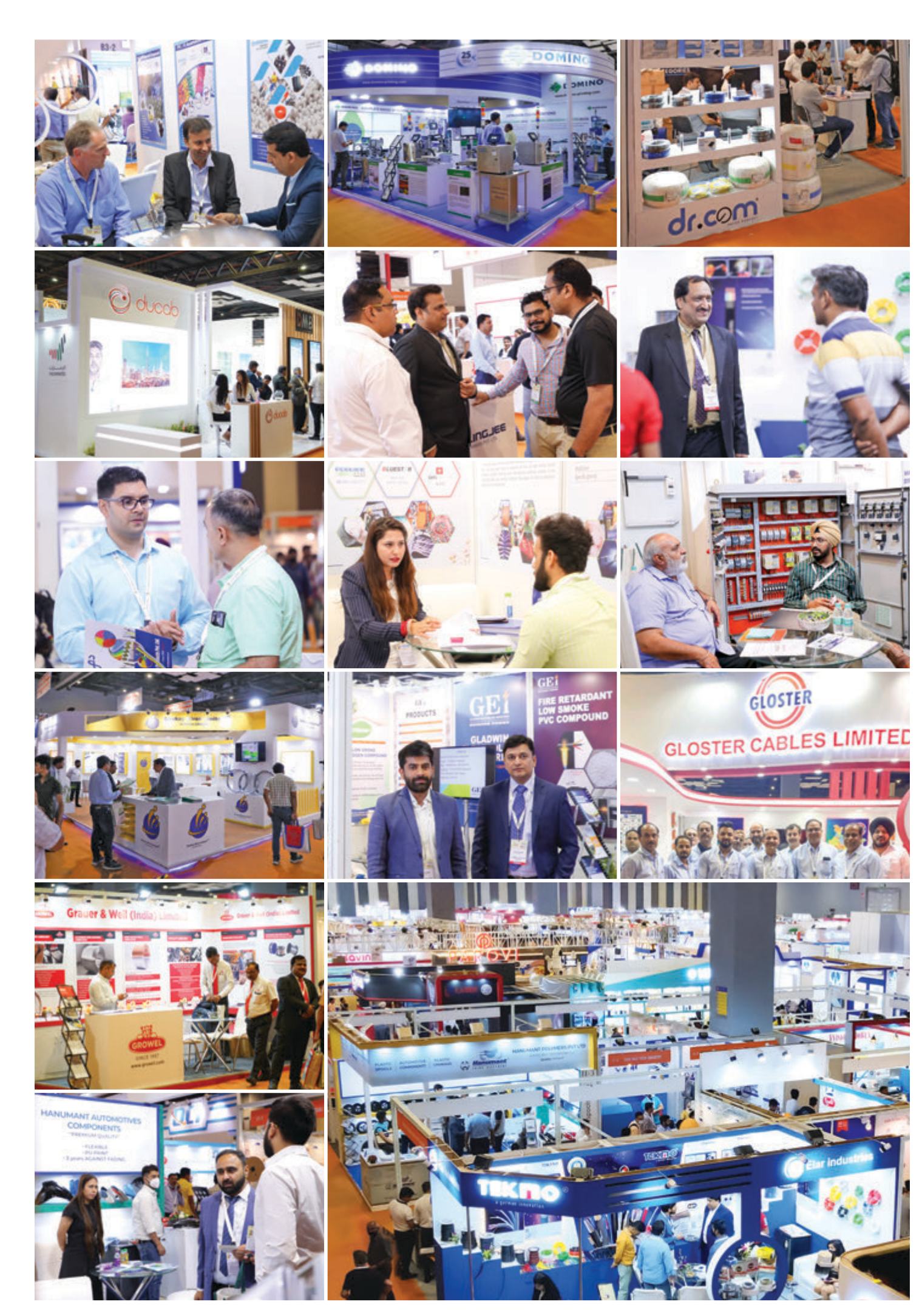
Cable & Wire Fair 2022 - SHOW REPORT