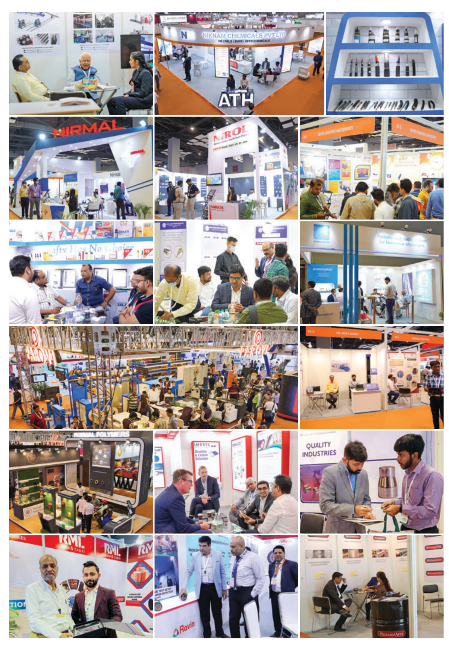
Cable & Wire Fair 2022 - SHOW REPORT