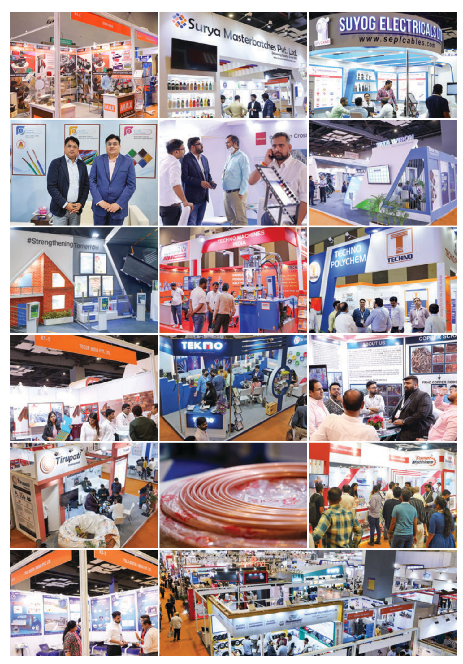
Cable & Wire Fair 2022 - SHOW REPORT